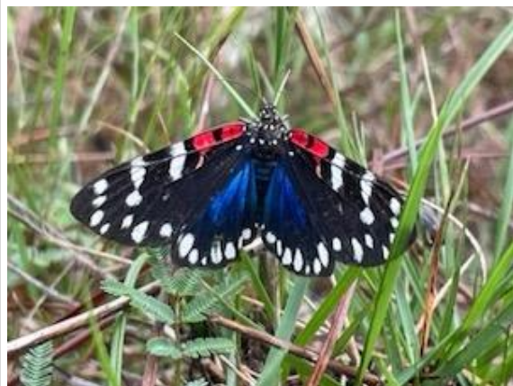
Faithful Beauty Moth.

Donations allow us to provide important conservation services such as improving our free online resources, increasing protection of rare plants and animals, restoring native ecosystems, and advocating for better public policy.