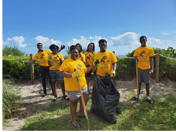
Students participating in a field restoration event at the beach in Delray Beach.